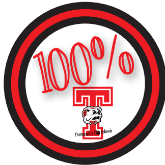
Schools Met or Exceeded Growth