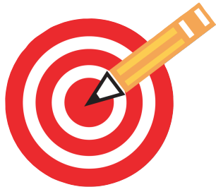
100% of Schools Met State Participation Targets